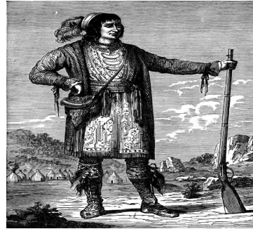
Osceola: Chief of the Ottawa Tribe