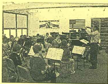
HMS Band Rehearsal

Learning to play an instrument or singing in the choir and belonging to a musical ensemble opens up a whole new world of friendship and fun. Music provides a great foundation for your child in all aspects of life. In addition to music, students learn self-discipline, group cooperation, problem-solving, goal-setting, memory skills, concentration, and the importance of team work. Like all the arts, music has a profound effect on the academic success of students as well. The opportunities for playing an instrument after high school are abundant, with many universities offering scholarships for participation.